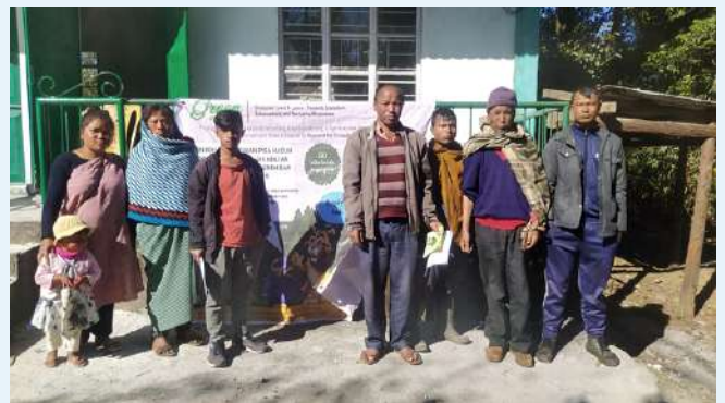
Awareness program at Laitmawroh village of Khatarshnong Laitkroh block.