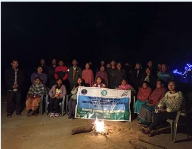
Micro Plan activity at Rongpetchi