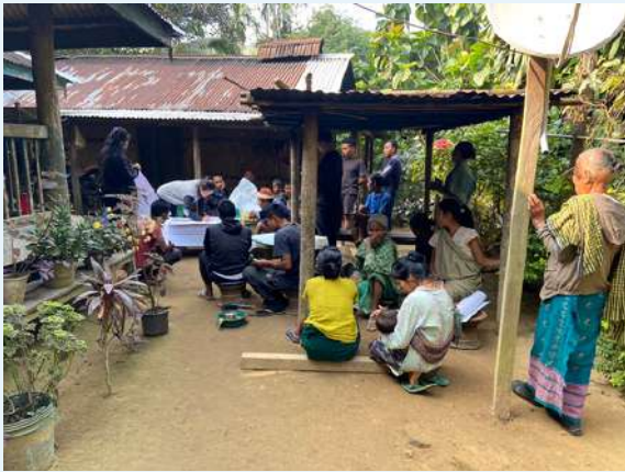
Micro planning at Dompaigne village.