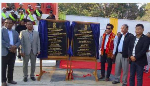
Laying of foundation stone of Adokgre and Baghabatta Market under North Garo Hills Dist by Hon'ble CM of Meghalaya in presence of MLAs and othe dignitaries at Adokgre.