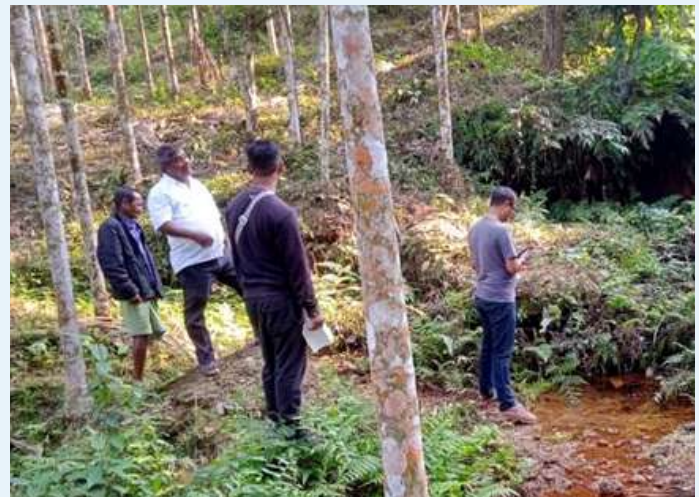
Capturing of Prospective Interventions in CLART app and FGD exercise with the community was completed at Koraitola village, Zikzak Block, South West Garo Hills