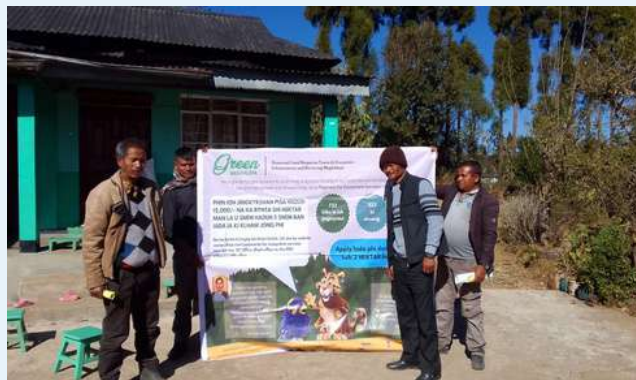
Mawiapbang village, Mawkyntrew block