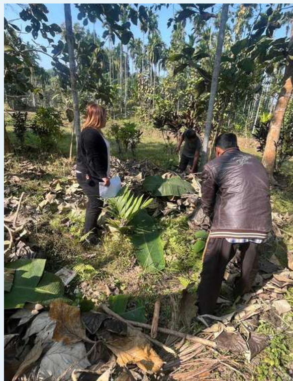
The Field Engineer (FE) visited Tinsimina IVCS for Ginger Processing Unit site for site survey & geo tagging .