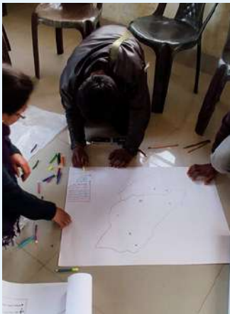
Exercise on Focus Group Discussion, HH surveys, Causation diagram, Land use zonation & intervention map conducted at Laitmynsang Village