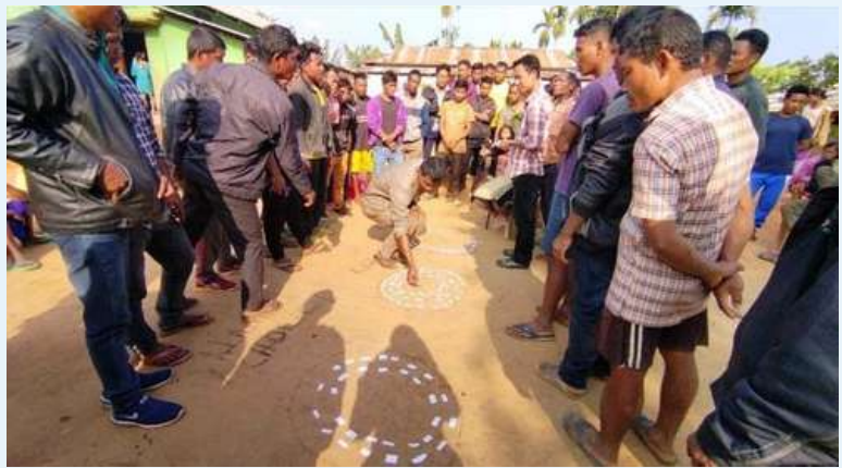
Community taking part in wealth ranking exercise