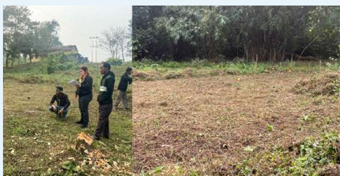
Site clearance and final measurements have started at Nangrime IVCS for Ginger Processing Unit, under Kharkutta, NGH