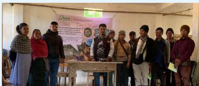
Iongnoh. Thadlaskien block