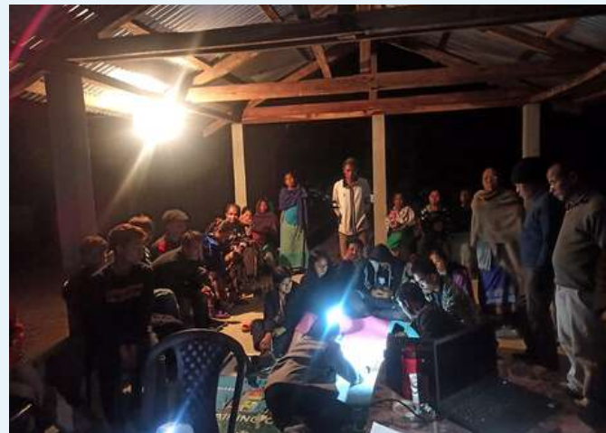
PLUP & Microplan activity at Abendagre village