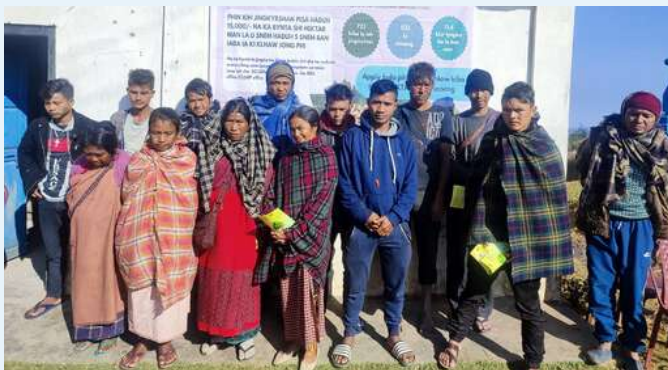
Awareness program at Mawphyrnai village. GFA from Mairang block.